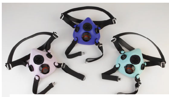
North RU8500, shown in lilac, royal blue, and light green with standard industrial exhalation valve cover.